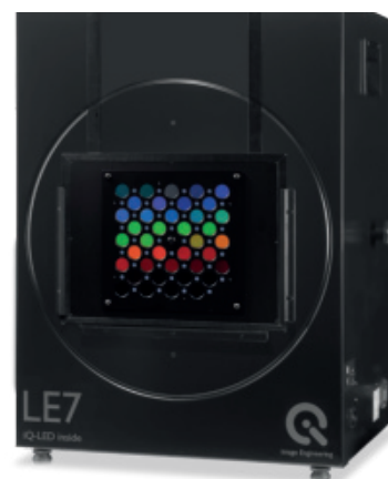
LE7 with TE292 XL