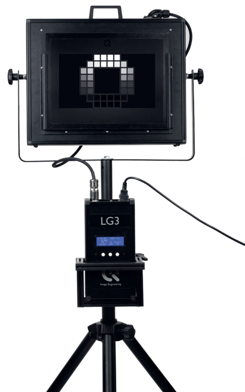
LG3 with support