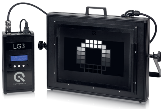
LG3 with OEFC test chart TE269C

The LG3 works in sync with our high dynamic range test targets such as TE269C. Targets with such high dynamic range require powerful illumination to generate a realistic signal for the camera under test. Flickering light sources (e.g., PWM driven LEDs) are an issue for cameras in many applications. The LG3 can generate these light sources in your test lab to evaluate how well a camera can handle these light situations.