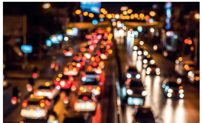
A wide range of light frequencies that are capable of being recreated with the LG3